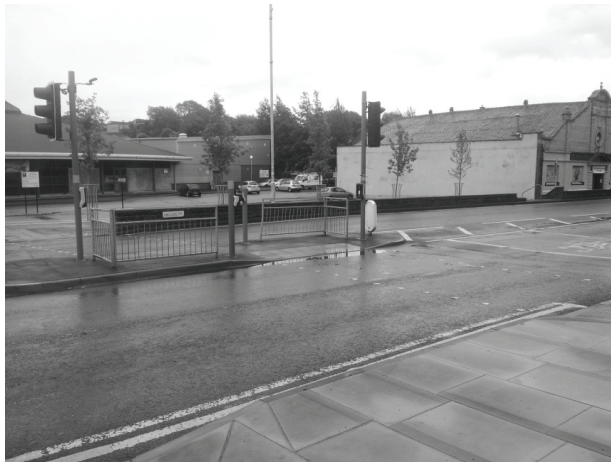
Figure 4. Site of the former Palace Theatre, June 2012.

In 2010 the theatre was therefore demolished, and the site has now been converted to car-parking use (Figure 4). Would listing it have 'saved' the building and ensured its continued use though? The local community, as well as a large number of theatre groups and national organizations, were in favor of restoring and using the building, but often with buildings such as these that are designated, if an economically viable use cannot be found, the building is left to decay and is not used sustainably, as was the case with the Tameside Hippodrome below.