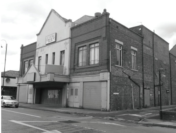
Figure 5. Tameside Hippodrome, 2012.

when the decline in audiences led to plans for the building to be converted to a bingo hall. On the announcement of this, the Friends of Tameside Theatre formed and successfully petitioned for the retention of the building as a theatre, and it was instead purchased by the borough council, who ran it as both a cinema and a theatre/concert venue until 2008, when Live Nation, who had been managing the site, did not renew their operating contract (English Heritage, 2009b).