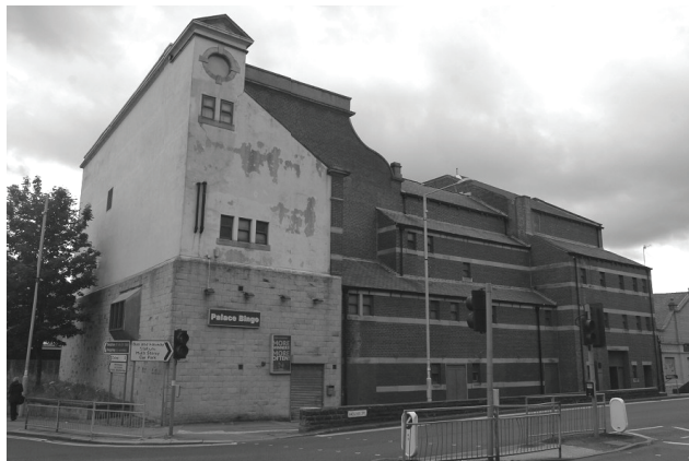
Figure 3. The Place Theatre, Nelson, 2009.

The Palace Theatre in Nelson was designed specifically as a variety theatre by the architectural practice of Matthew, Watson, Landless & Pearse (Figure 2). It opened in December 1909, and provided variety shows, theatrical and operatic productions and Saturday picture matinees for the local community (English Heritage, 2009a). During the 1920s the building began to be used predominantly as a cinema, being formally transformed as such in 1937 when the foyer was altered and the building was redecorated, although it was still used for theatrical performances until 1958. From 1960 onwards it was then transformed into a bingo hall, and remained in use as such until its closure in 2009. However, the building underwent significant modification in 1977 (Figure 3) when the main entrance and a dominant corner tower were demolished due to a road widening scheme, along with the foyer and front-of-house area (English Heritage, 2009a).