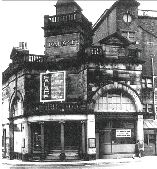
Figure 2. The Palace Theatre, Nelson, 1960.

The Palace Theatre in Nelson was designed specifically as a variety theatre by the architectural practice of Matthew, Watson, Landless & Pearse (Figure 2). It opened in December 1909, and provided variety shows, theatrical and operatic productions and Saturday picture matinees for the local community (English Heritage, 2009a). During the 1920s the building began to be used predominantly as a cinema, being formally transformed as such in 1937 when the foyer was altered and the building was redecorated, although it was still used for theatrical performances until 1958. From 1960 onwards it was then transformed into a bingo hall, and remained in use as such until its closure in 2009. However, the building underwent significant modification in 1977 (Figure 3) when the main entrance and a dominant corner tower were demolished due to a road widening scheme, along with the foyer and front-of-house area (English Heritage, 2009a).