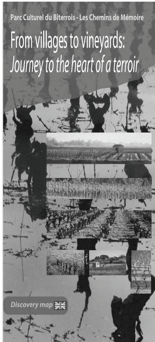
Figure 5. Discovery map "From villages to vineyards, a journey to the heart of a terroir" ("Parc culturel du Biterrois")