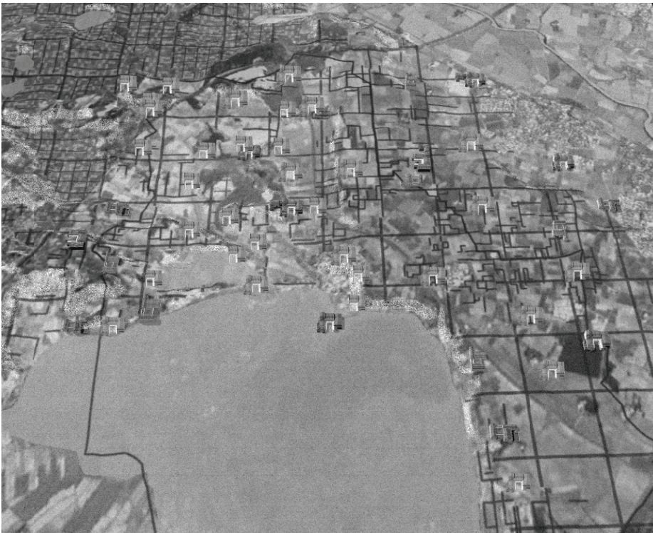
Figure 3. Ancient cadastration surveys and villas in Vendres.

They both highlighted the fossilization of Roman cadastral surveys and they put forward the keys to understand the evolution of the present-day landscape through diachronic readings showing how ancient roads, lands or fields left their marks until today. The ancient agrarian structures in the Biterrois characterized by vineyards have imprinted the landscapes as well as the people's memories. In that sense, those historical landscapes are also cultural landscapes, and Roman country planning is still reflected in nowadays rural areas (Figure 3). Vineyards have constructed and structured the Biterrois landscapes for nearly more than two thousand centuries. With the other ancient lanes like the famous Via Domitia , they are considered as essential parts of ancient heritage (Clavel-Lévêque, 2008).