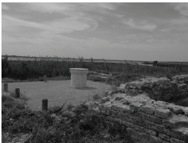
Figure 2. Ruins of the Temple of Venus (Vendres) and the lake of Vendres.

In the second half of the 17 th century, Anne de Rulman, Guillaume Catel and Louis Coulon studied and referred to ancient monuments which had already been deteriorated through time. However, those scholars could identify without a doubt the monuments as ancient because they relied on the writings by ancient authors. The monuments could be defined so, at that time, because they were made with columns. The column was the vertical element that symbolized what was, in essence, antique. In his manuscript, Folio 147, for example, Rulman included drawings that made visible how the monuments used to look like with columns (Figure 2). With that sort of ahead of time anastylosis , he made the symbolic importance of the landscape stand out quite significantly for in situ heritage. In his drawing of the temple of Venus , the monument was taken as a part of the landscape situated between the lake of Vendres and the Mediterranean Sea. At that time, Béziers colony was indeed not far from the sea which was in contact with the lake. Therefore, through his drawing, Rulman did manage to enhance the close link between the sea and the Biterrois that ancient authors had established much earlier (Figure 2).