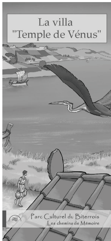
Figure 6. Brochure from the Biterrois Cultural Park with guidelines for the visit of the Temple of Venus (Vendres)

Furthermore, and in seeking better acknowledgement of this archeological site, and in collaboration with the French coastline conservation authority, the scientific team fit up a memory path ("un chemin de mémoire") around the villa and the lake. They also published a brochure with guidelines for the visit including archeological information and explanations (Figure 6).