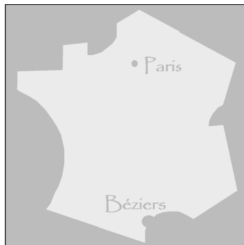
Figure 1. Location of Béziers.

The Regional Council of Languedoc-Roussillon (South of France) has recently launched a tourist promotion campaign focusing on the theme of water. A series of posters has been published, each presenting a toponym, a brief comment, and an aerial photograph. One of those posters called "the Ensérune Oppidum" is focused on the western Biterrois, the area situated around the town of Beziers in France (Figure 1). Our attention is immediately attracted to the mid-section of the poster where we can see a sun-shaped area below the following comment: "Oppidum d'Ensérune (Hérault) : l'irrigation façonne le paysage depuis l'époque gallo-romaine, comme à Ensérune.", meaning that the Ensérune Oppidum is a good illustration of the fact that irrigation has designed landscapes since the Gallo-Roman area.